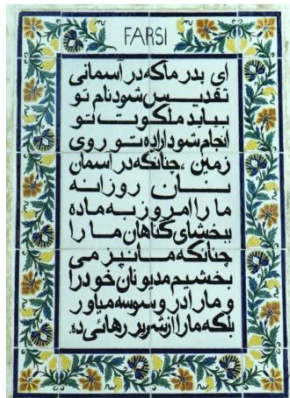
The Lord's Prayer in Farsi

2075 EAST MADISON AVENUE • EL CAJON • CALIFORNIA 92019-1108